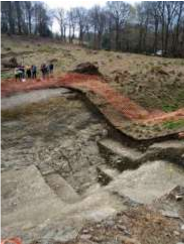
The Ditch, Wooston Castle