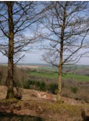
The Long View

We are now beginning to get things organised for this year's dig, (30 th June to 25 th July).