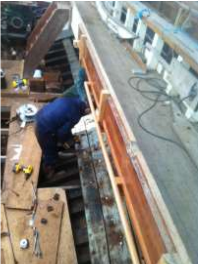
2. Refastening the bilge stringers

We have now removed nearly all the interior fittings allowing access to the hull and frames. Two very large planks of wood that are called the bilge stringers, which run fore and aft half way between the keel and the deck, have now been refastened – a job that has not been done since she was built in 1915, so it was very important to be able to complete that task. Some of the nails that came out were very tired! ( Pictures 1 and 2 ).