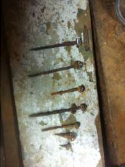
1. Original nails from bilge stringers

Since our last contribution to Distinctly Winkleigh work has continued on Britannia, and much progress has been made, thanks to all our loyal volunteers.