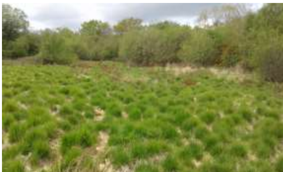
Typical Molinia Culm Habitat